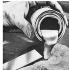
Lab-metal spreads like paste and hardens into metal. Application tip: wet the applicator with Lab-solvent to aid in smoothing the Lab-metal and reduce "pulling".

Lab-metal's unique formulation allows for three methods of application: spreading, brushing or spraying. Instructions for each of the three methods follow: