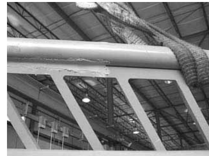
Lab-metal is applied with a putty knife to finish a rough weld. The hardened Lab-metal is then sanded smooth, providing a paintable, permanent metal finish.

Spray painting Lab-metal, to rustproof large surface areas: An internal mix spray head should be used, set at roughly 65 pounds of air pressure to eliminate clogging. For larger quantities, an agitator tank should be used (consult spray equipment dealer). Clean the gun thoroughly with Lab-solvent immediately after use. When applying Lab-metal in closed areas (such as tank interiors), proper ventilation must be provided and NIOSH approved self-contained breathing apparatus should be used. Any striking of metal on metal that could cause sparks must be avoided.