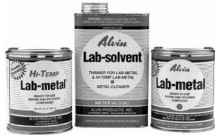
Hi-Temp Lab-metal (withstands temp's to 1000°F), Lab-solvent (thinner, metal cleaner), and Lab-metal (for repairs to 350°F or one-time exposures to 425°F).

Lab-metal may also be thinned to paint consistency with Lab-solvent and brushed or sprayed on practically any surface – including wood and cement – to provide a rustproof, water resistant, hard metal finish.