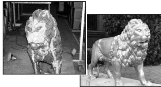
Before and After: Hi-Temp Lab-metal was used to patch cast iron lion statues in an historic restoration project.

Hi-Temp Lab-metal is recommended where original Lab-metal may not withstand the extreme heat. Originally developed to meet foundries' core box repair needs, industries such as metalworking, powder coating, welding, fabricating, heating, construction, auto repair, die casting, mold refinishing, and sheet metal production and finishing now rely upon Hi-Temp Lab-metal.